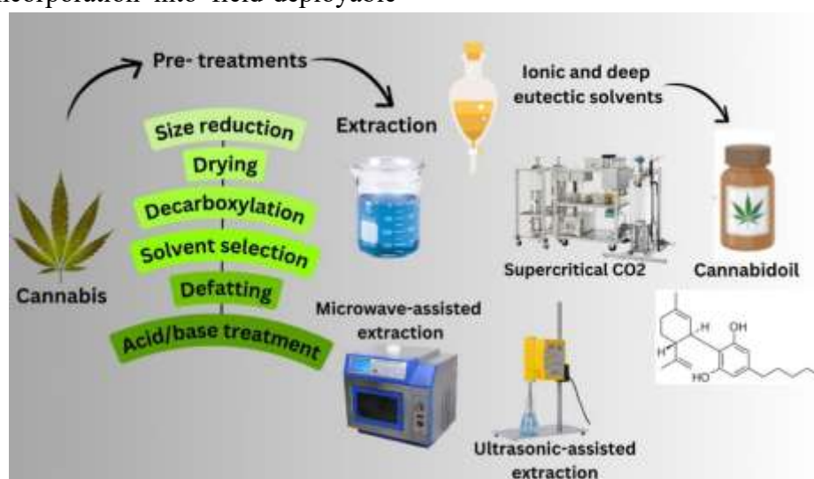
Figure 1: Extraction Process of Cannabidiol (CBD) from Cannabis

instrumentation. 14 Each of these technologies has distinct advantages and limitations: while immunochromatography is rapid and user-friendly, it may lack the sensitivity and multi-analyte capability of chromatographic methods; spectroscopy offers high throughput and minimal sample preparation but requires robust calibration and may be affected by matrix effects; and electroanalytical sensors provide rapid, sensitive detection but are still in the early stages of validation for complex matrices. 15 Figure 1 illustrates the stepwise process for cannabidiol (CBD) extraction from Cannabis , beginning with pre-treatments such as size reduction, drying, decarboxylation, solvent selection, defatting, and acid/base treatment. To achieve effective separation of cannabidiol, diverse extraction methodologies are employed, encompassing electromagnetic wave-facilitated, sound wave-aided, and pressurized carbon dioxide above critical state processes, alongside the utilization of molten salt and low-melting-point solvent systems. The final outcome is a purified cannabidiol extract, commonly used in pharmaceutical and therapeutic formulations.