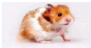
Figure 2: Common Laboratory Animals