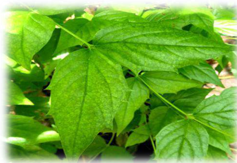
Fig.1 Leaves of Nyctanthes arbor tristis

Nyctanthes arbor tristis is also referred to as night flowering jasmine, parijat, and shiuli. It is a member of its own family of Oleaceae [11]. The plant is found in South Asia and Southeast Asia. It is a small tree 10-30 ft long [12]. Their leaves are simple and opposite 6-12cm long and 2-6. Five cm wide with the entire margin [13]. This tree is at times referred to as the Tree of Sorrow because the plant life of this plant becomes dull in the evening. This plant has further mentioned its role and significance in our Veda [14]. The leaves of this plant are used in ayurvedic medicines and homeopathy and domestic medications to cure pain and fever, and various infections. Nyctanthes arbor tristis , contains mannose and glucose that forms a mucilaginous layer around the urinogenital, gastrointestinal, and respiratory tract upon oral consumption [15-17]. The layers catch the microbial flora and render them incapable of invading the system. Hence, the bacteria are unable to develop in the media with Nyctanthes arbor tristis extract. The leaves of this species contain many active compounds such as D-mannitol, \beta -Sitosterol, Flavanol, Glycosides, Nicotiflorin, Oleanolic acid, Tannic acid, Ascorbic acid, Methyl salicylate, glycosides, carotene, glucose, and benzoic acid [18-20].