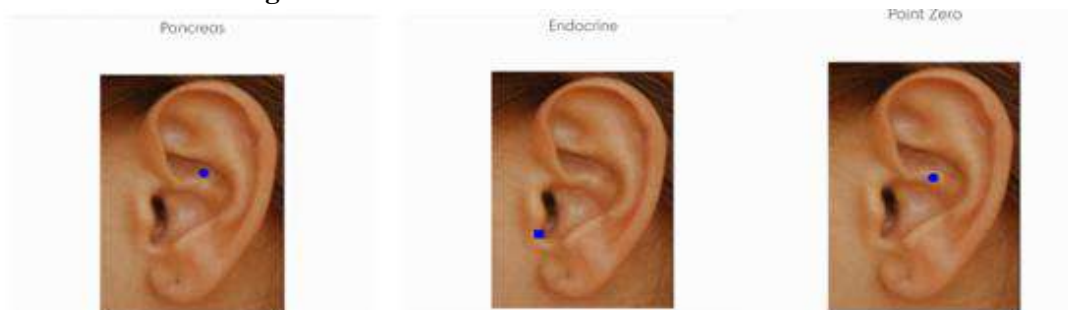
Figure: 2 – Intervention Point and Its Location

intervention will be monitored and managed appropriately.