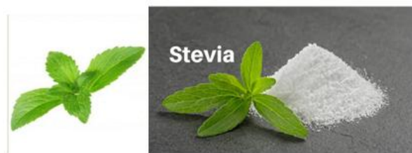
Figure 2: stevia leaves