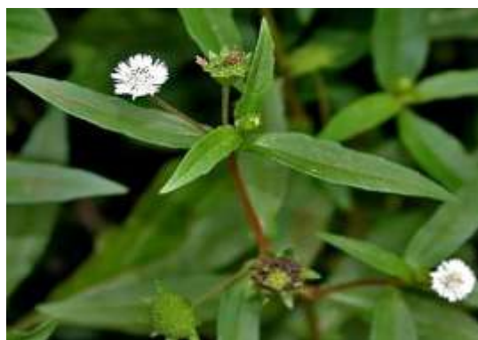
Fig.1: ECLIPTA ALBA