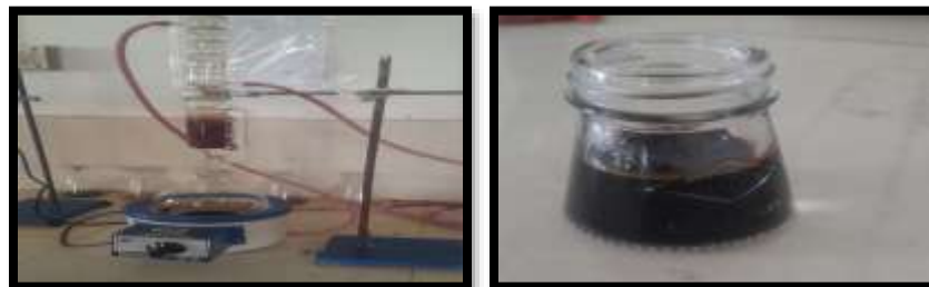
Fig . No.5.Soxhlet Apparatus Extraction Process of Rosa Sinensis (Hibiscus)

Solvent evaporates → condenses → extracts compounds Continue extraction for 6–8 hours Process completes when solvent becomes colorless.