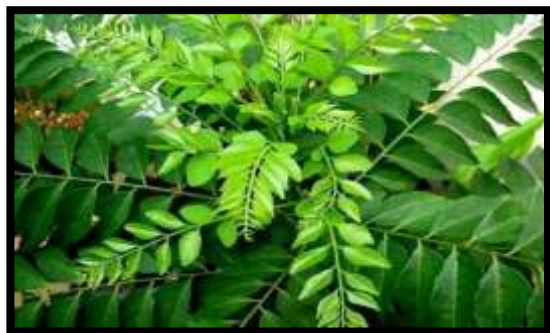
Fig. no. 2. Leaf of Murraya koenigii (Curry leaves)