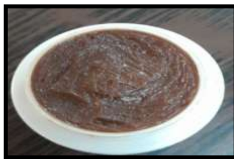
Fig no.6. Herbal ointment