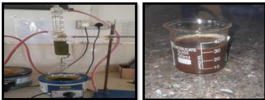
Fig.No.4. Soxhlet Apparatus Extraction Process Of Curry Leaves(Murraya Koengii )