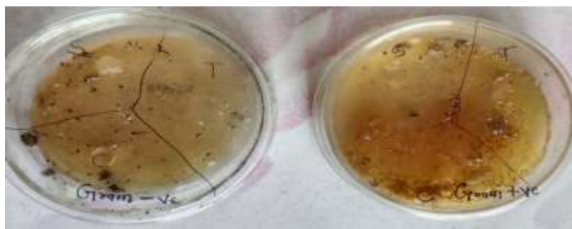
Fig no. 15. Microbial test for herbal ointment