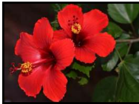
Fig.no.3. Hibiscus ( Rosa Sinensis )