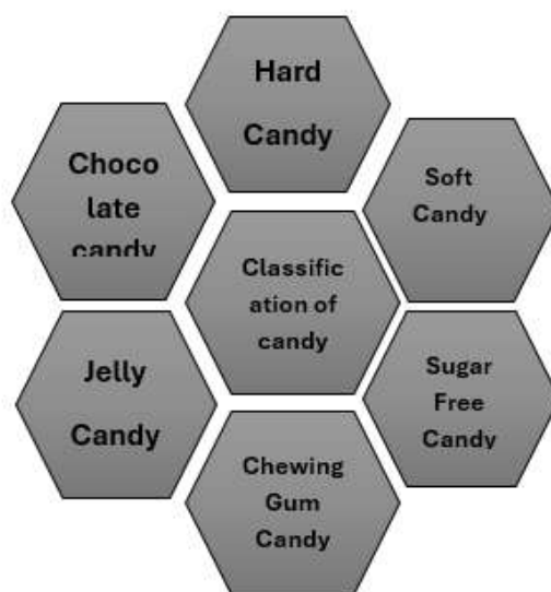
Fig 1: classification of candy [3]