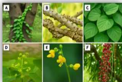
Fig 3: Morphology of giloy plant [6]

Tinospora cordifolia contains diverse phytochemicals, including alkaloids, phytosterols, glycosides, tinosporide, and various other phytochemicals.