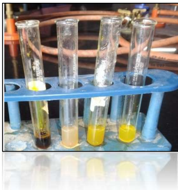
Fig 12: Alkaloid testing