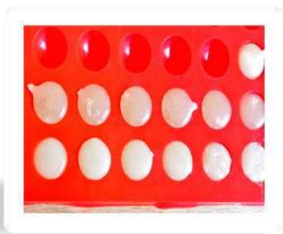
Fig 9: Molding of sample solution