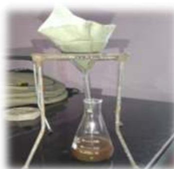
Fig 8: Filtration of concentrated extract