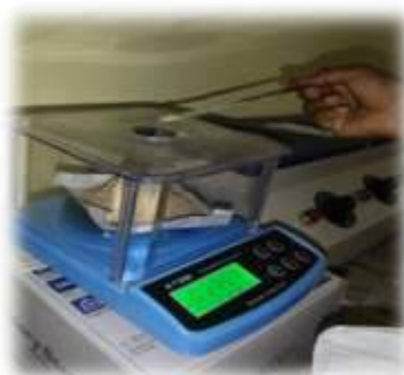
Fig 7: Weighing a sample