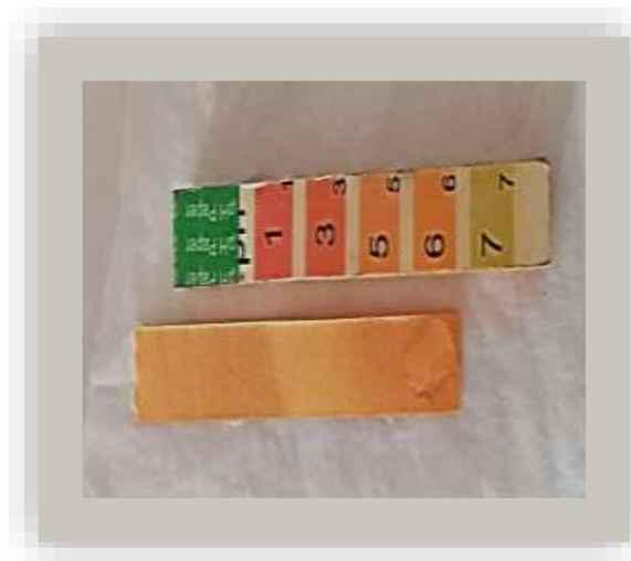
Fig 11: pH determination

Evaluated for stability, generally in the acidic range (5-6) to prevent bacterial growth.