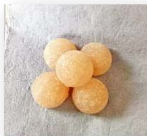
Fig 10: Formulation of candy