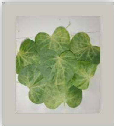
Fig 2: Giloy leaf