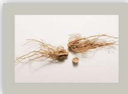
Fig 4: Morphology of giloy plant [7]