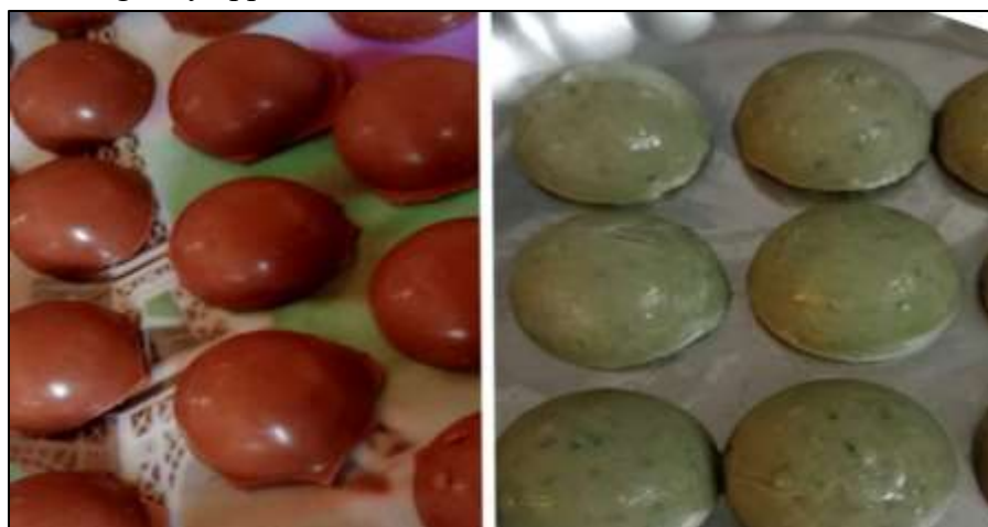
Figure 05: General appearance of Herbal Chocolate Formulation

formulation 2 was light green with a chocolate odour, sweet taste, smooth soothing mouthfeel, and glossy appearance.[35,36]