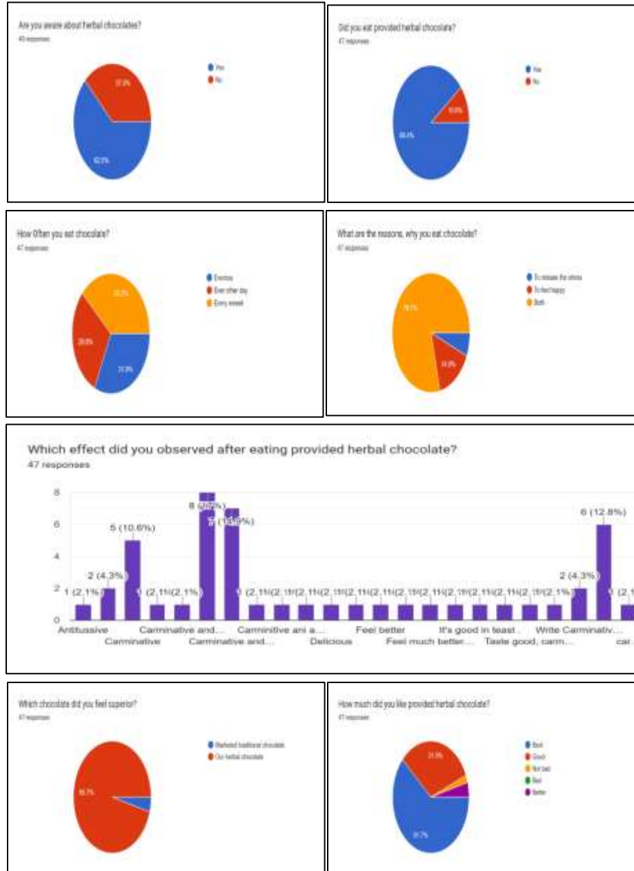
Figure 05: Peoples reviews on Herbal Chocolate Formulation