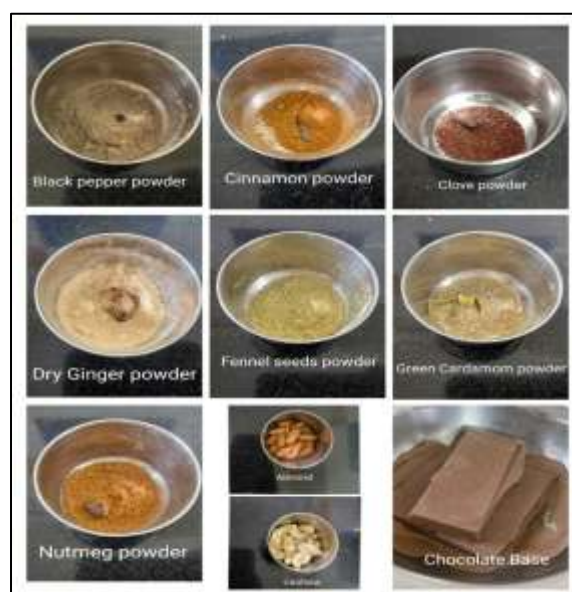
Figure 01: Formulation-I ingredients