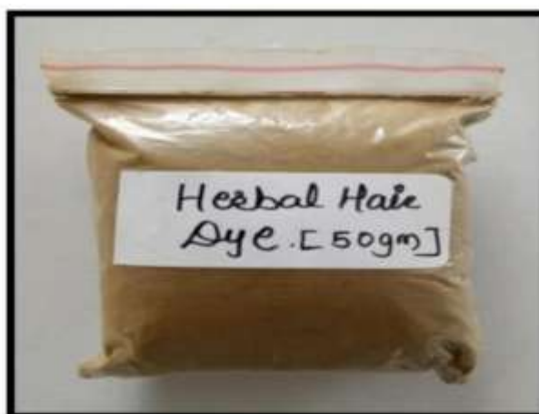
Fig : Formulation of Herbal Hair Dye