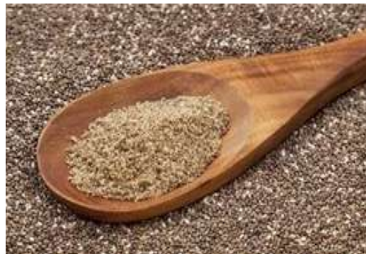
Fig 5: Chia seeds

Biological source: Chia seeds are the edible seeds of flowering plant Salvia hispanica and it is an annual herbaceous plant.