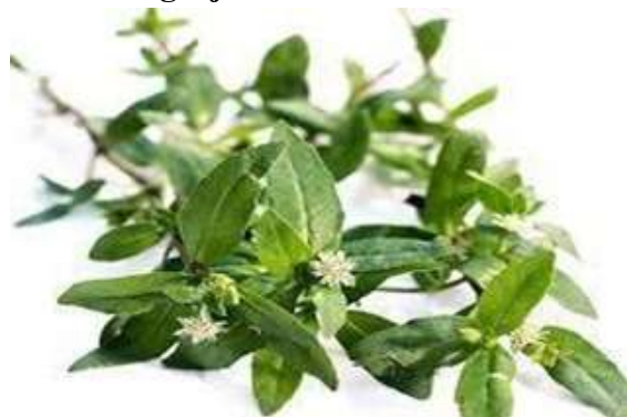
Fig 7: Bhringraj

Biological source for Bhringraj is Eclipta prostrata or Eclipta alba belonging to the Asteraceae family. The plant is known by several other names, including false daisy.