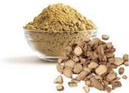
Fig 4: Kapoor kachri

Biological source: It is the rhizomes of Hedychium spicatum. This plant is commonly known as spiked ginger lily or perfume ginger.