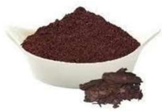
Fig 3: Ratanjot

Biological source: Ratanjot, also known as alkanna tinctoria, derives from the roots of the Alkanna tinctoria plant. This plant, commonly referred to as dyer's alkanet.