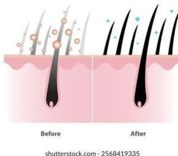
Fig 1: Herbal Hair Coloring: Before and After