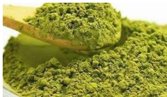
Fig 7: Arapu powder

Biological source: It is obtained from the leaves of Albizia amara , it is a small to medium sized deciduous tree with spreading crown.