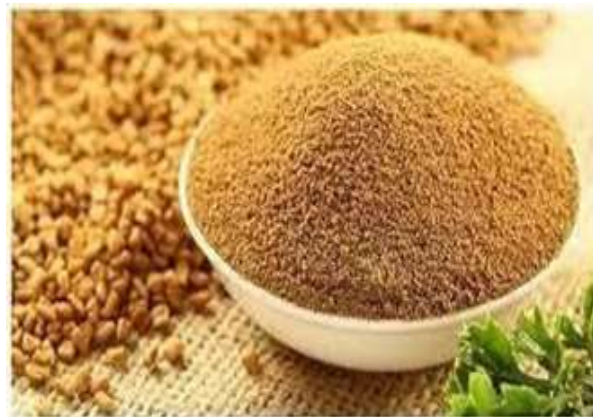
Fig 6: Fenugreek powder