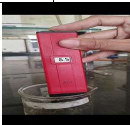
Fig: pH test