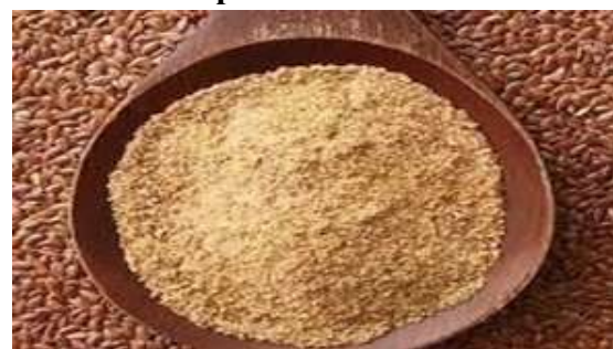
Fig 8: Flax seed powder

Biological source: Flax seeds consists of the strands of pericyclic fibers of the stem Linum usitatissimum Linn.