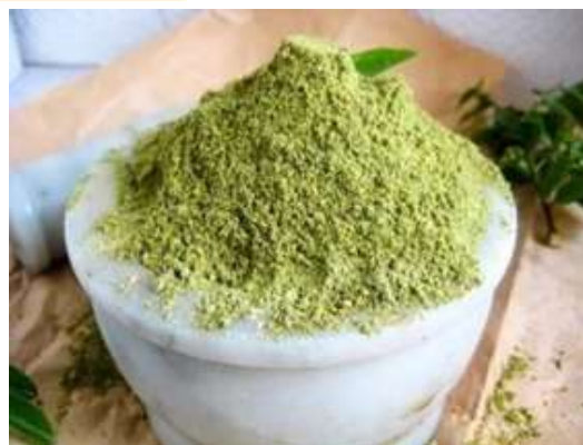
Fig 2: Henna

Biological source: It is obtained from the leaves of the plant Lawsonia inermis . These leaves contain a natural pigment called lawsone, which is responsible for the characteristic reddishbrown color imparted by henna.